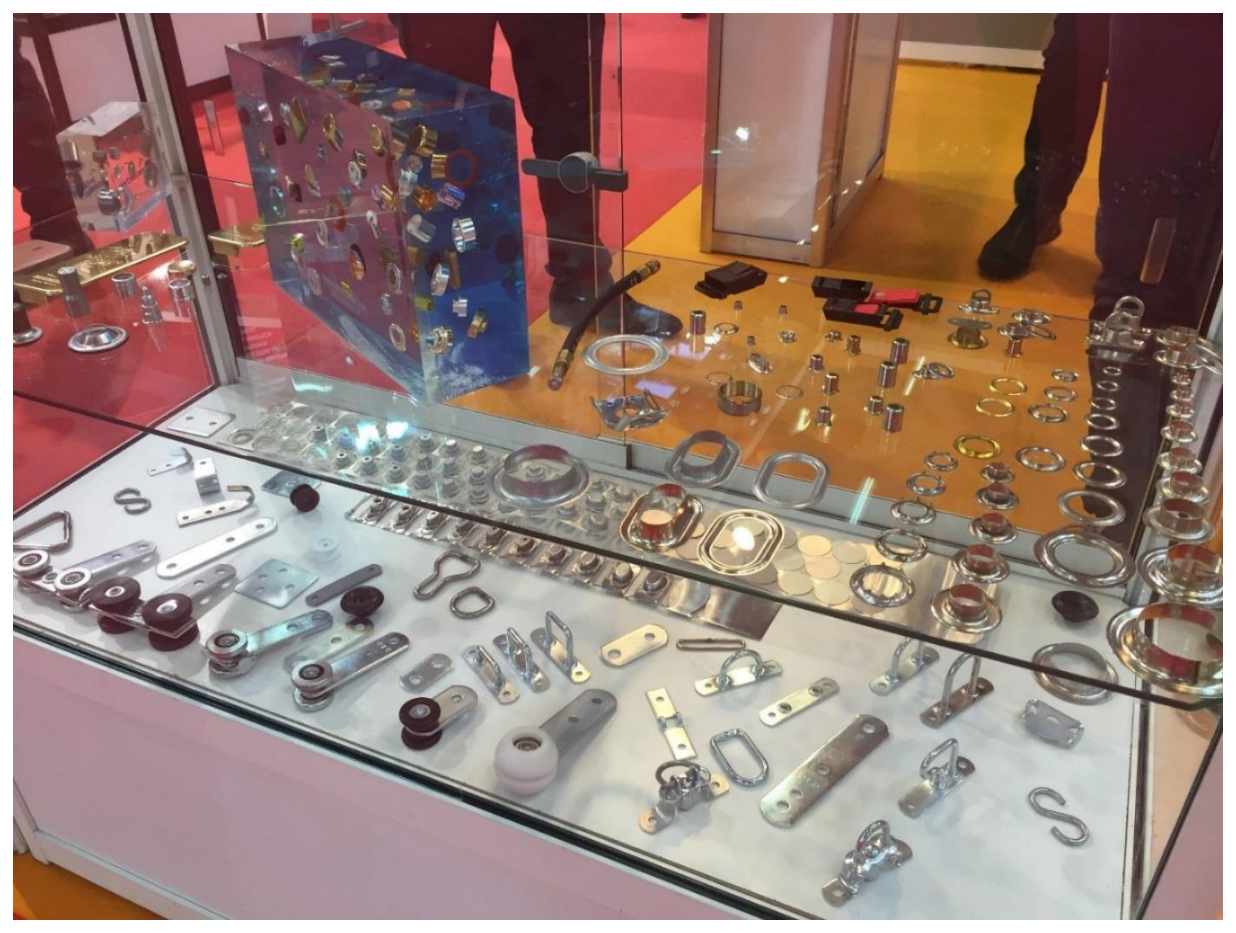
The Précitechnique and DED products exhibited at Micronora in September 2016

Through their countless fields of application and their strong international reputation, the two companies have a valuable asset that allows visitors to find the solution to their investment and development projects.